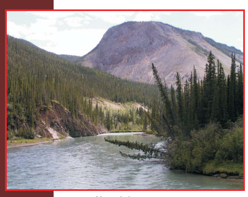
Moose Lake

The B.C. Government is currently working towards completing the wildlife plan, parks plan and the recreation plan.