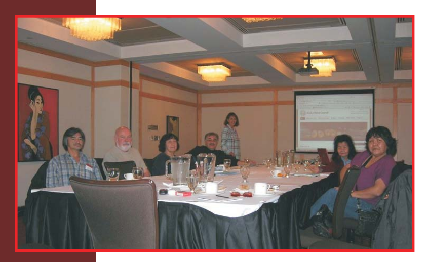
November 2009 Document Archival Workshop

It is expected that the technical aspects of the Document Archival System will be completed by the end of December, with the first phase of document uploading completed by the end of March, 2010.