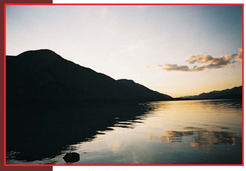
Muncho Lake